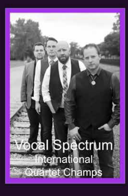
Capitol Ring Family Fun with Award-Winning Harmonies