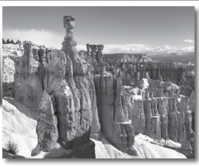
Winter in Bryce Canyon N.P. - no crowds, incredible beauty

3 shows, 5 nights at the Marriott in Times Square, Little Italy in The Bronx, 9/11 Memorial, A Day Behind Broadway. Inc. roundtrip air and 6 meals. $4150 p.p./dbl.occ., $4745 single