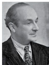
Patrick Hadley 1899–1973 Nightfall