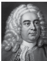
George Frideric Handel 1685–1759 Funeral Anthem