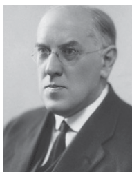
Sir Henry Walford Davies 1869–1941 Crossing the Bar