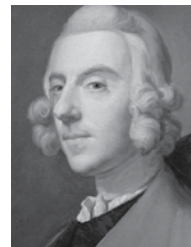
Thomas Arne 1710–1778 Rule, Britannia!