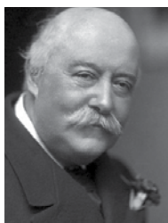
Sir Hubert Parry 1848–1918 I Was Glad Jerusalem My Soul, There is a Country