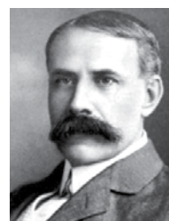
Sir Edward Elgar 1857–1934 As Torrents in Summer The Snow