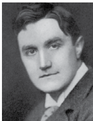
Ralph Vaughan Williams 1872–1958 Lord, Thou Hast Been Our Refuge