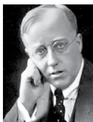
Gustav Holst 1874–1934 I Vow to Thee, My Country